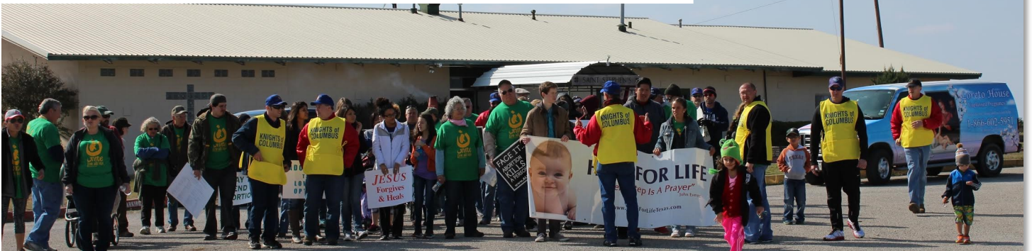
Walkers about to begin the 3.5 mile Hike for Life from Saint Stephen Church to Saint Stephen Chapel and back.