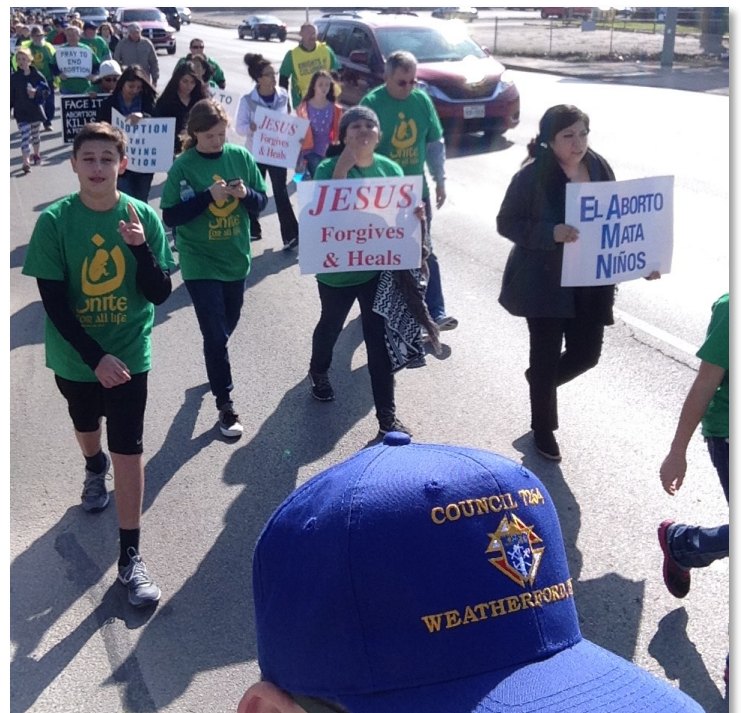
Hike for Life 2015 makes its way down Main Street.