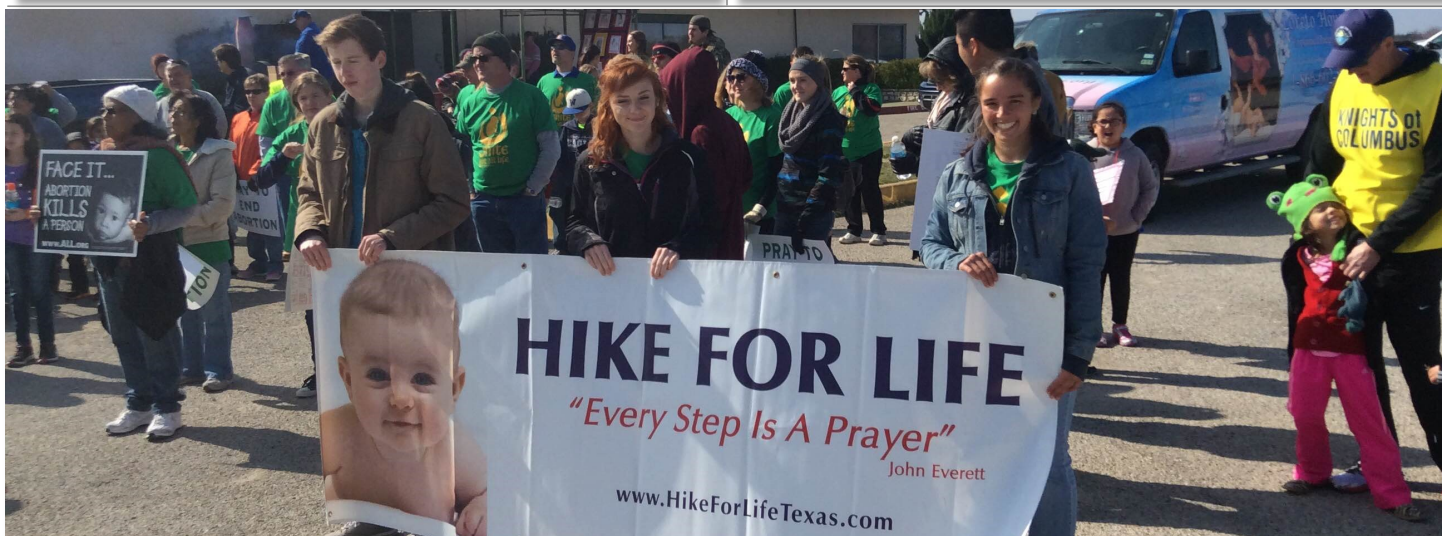
Members of our Saint Stephen Youth Group leading the way during the 2015 Weatherford Hike for Life.